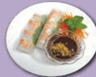
Fresh Basil Roll

Duluth 2148 Duluth Hwy 120, Ste 117 Duluth, GA 30097