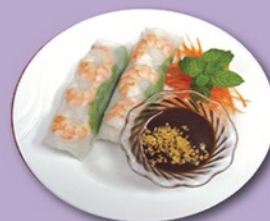
Fresh Basil Roll

Suwanee 320 Town Center Avenue, Ste C-8 Suwanee, GA 30024 (At Suwanee City Hall)